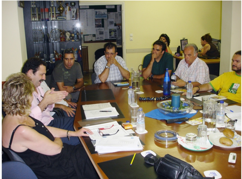
Members of EDSO, the EC and the H.A.D.F are discussing about the Technical Regulations of Bowling at the H.A.D.F's offices