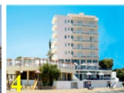
HOTEL ATTICA BEACH